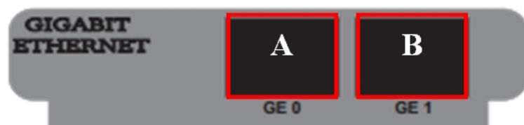
Fig. 2: Front of the PMC-2SFP Card

Figure 2 shows the front board of the PMC-2SFP card: