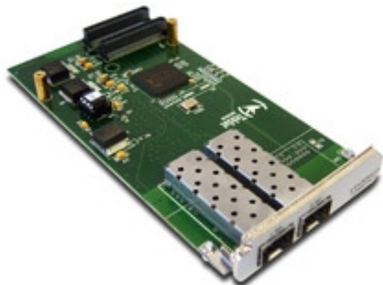
Fig. 1: PMC-2SFP Card

The PMC-2SFP card ( “Small Form-Factor Pluggable” ) provides connectivity to two Gigabit Ethernet devices or to two networks.